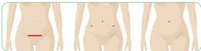
Open Surgery Incision

**With minimally invasive surgery, there are various options for removing the uterus. Your surgeon will recommend the option he/she thinks is best for you.